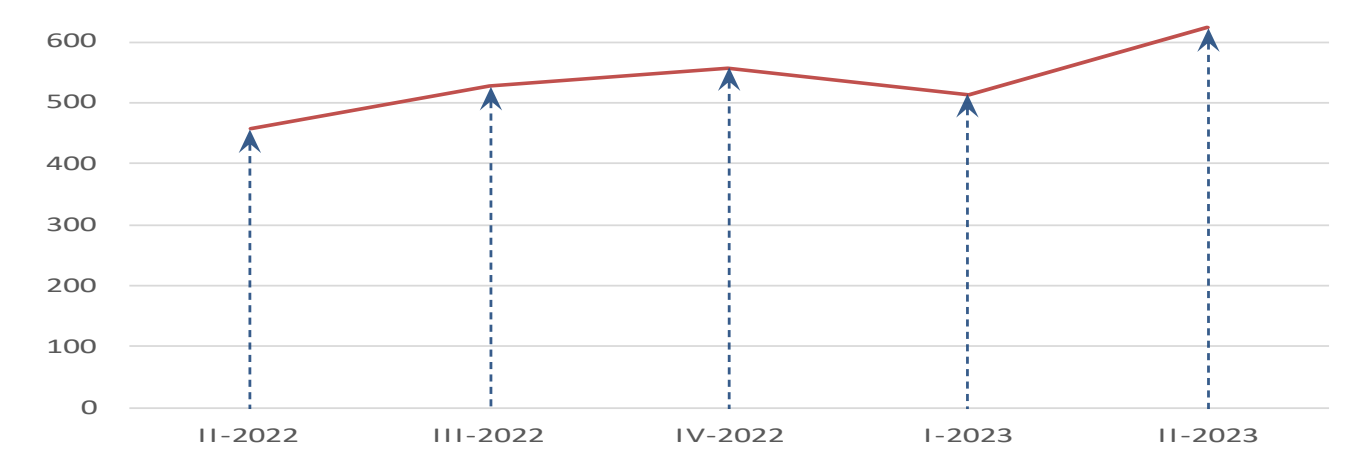
Graph 2: Transported cargo air traffic, tonnes