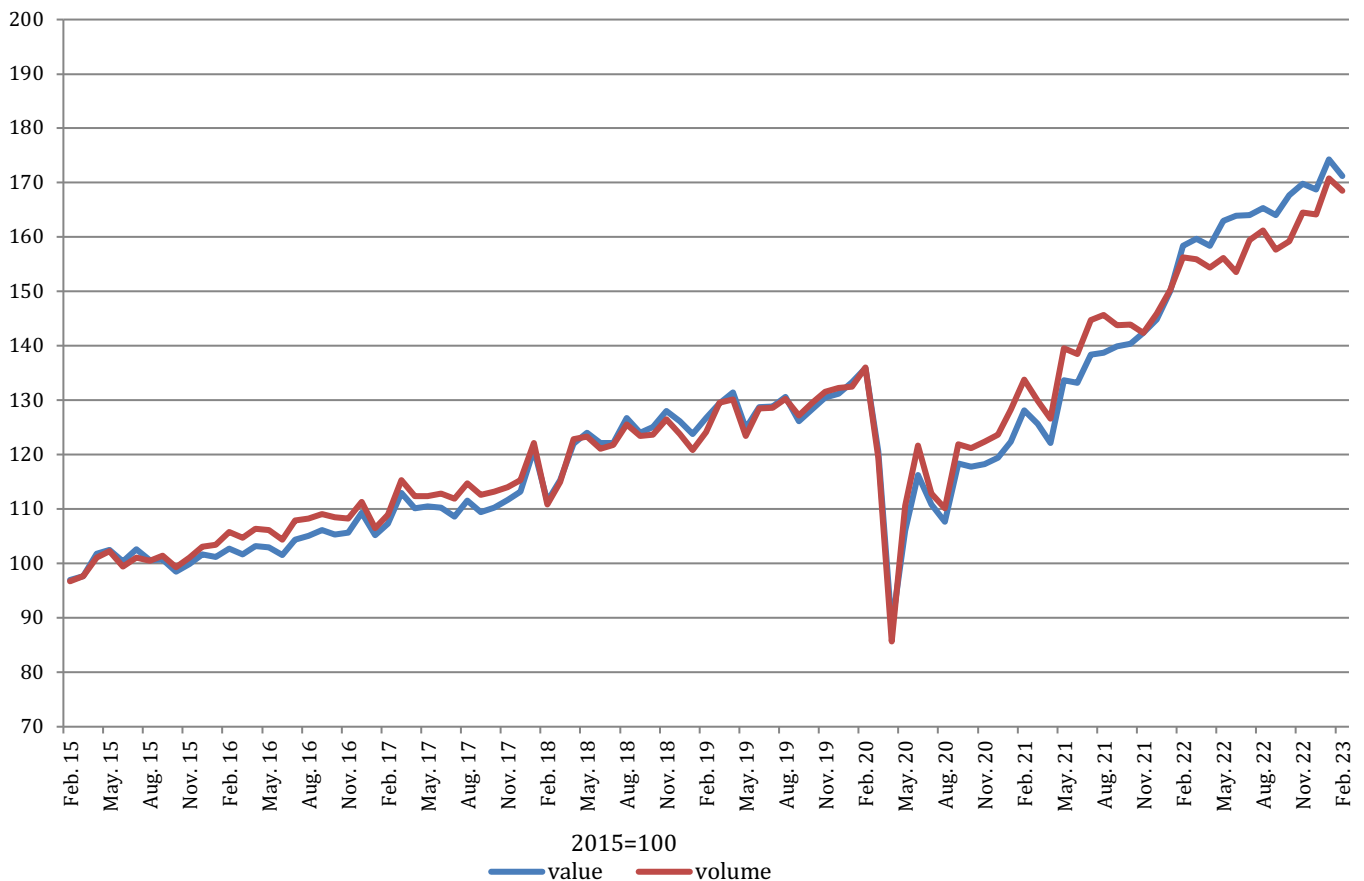
Indices of Retail Trade Turnover, seasonally adjusted series BiH, 2015=100