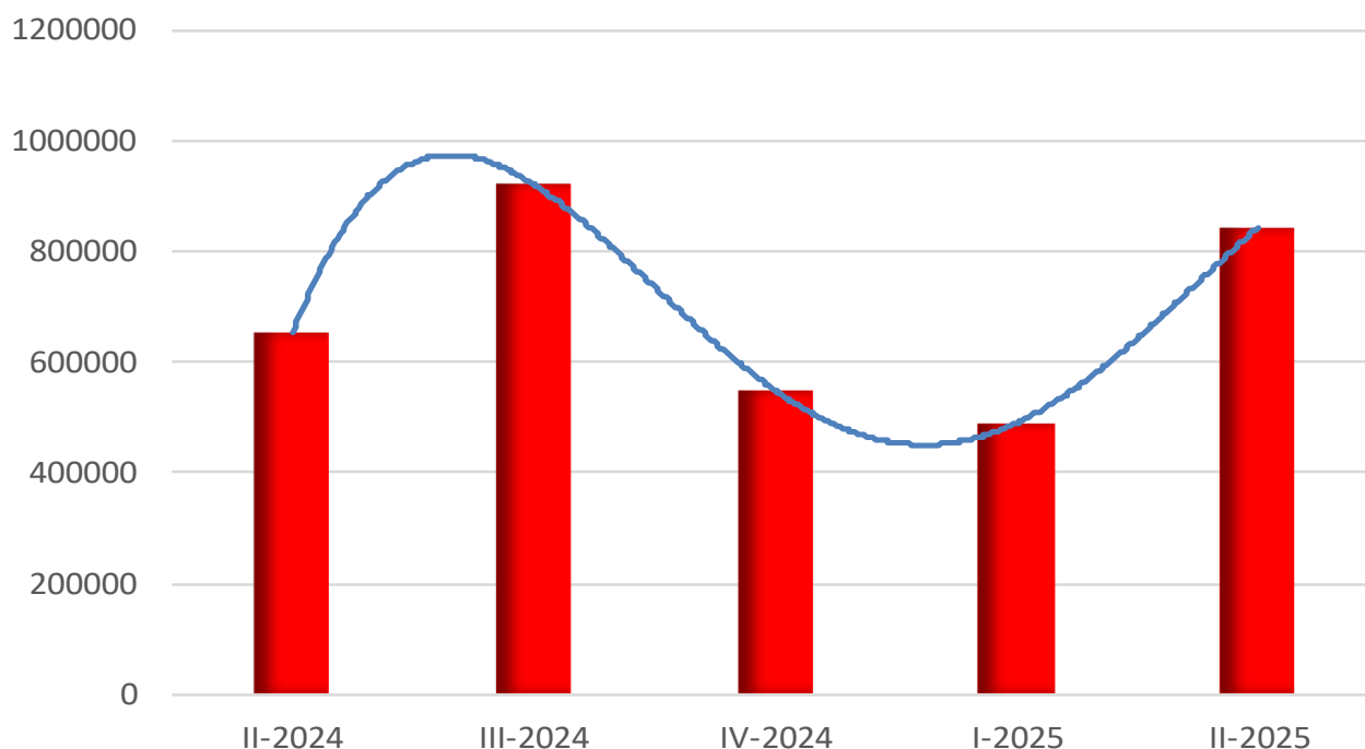
Graph 1: Number of passengers carried in air transport

The amount of mail transported by air in the second quarter of 2025 shows a decrease of 5.7% compared to the same quarter of the previous year.